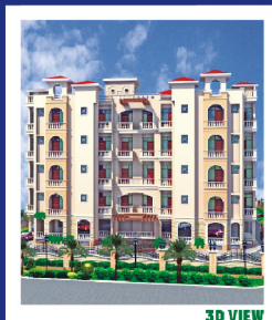
Rock Valley Apartment, Dehradun, U.K.