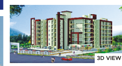
Rock Valley Residency, Dehradun, U.K.