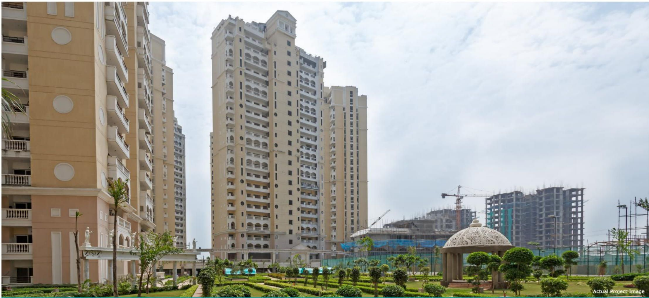
Actual Project Image