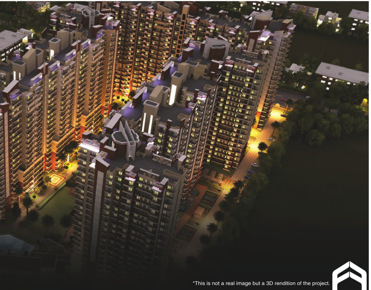
*This is not a real image but a 3D rendition of the project.