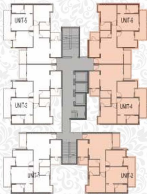
TOWER - 3, 4, 10 & 11