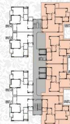
TOWER - 5, 6, 8, 9

3 Bedrooms + 3 Toilets Carpet Area = 86.75 SQM. (933.77 SQFT.) Balcony Area = 17.58 SQM. (189.23 SQFT.) Area Under External Walls, Columns & Shafts = 6.59 SQM. (70.93 SQFT.) Common Area = 34.55 SQM. (371.89 SQFT.)