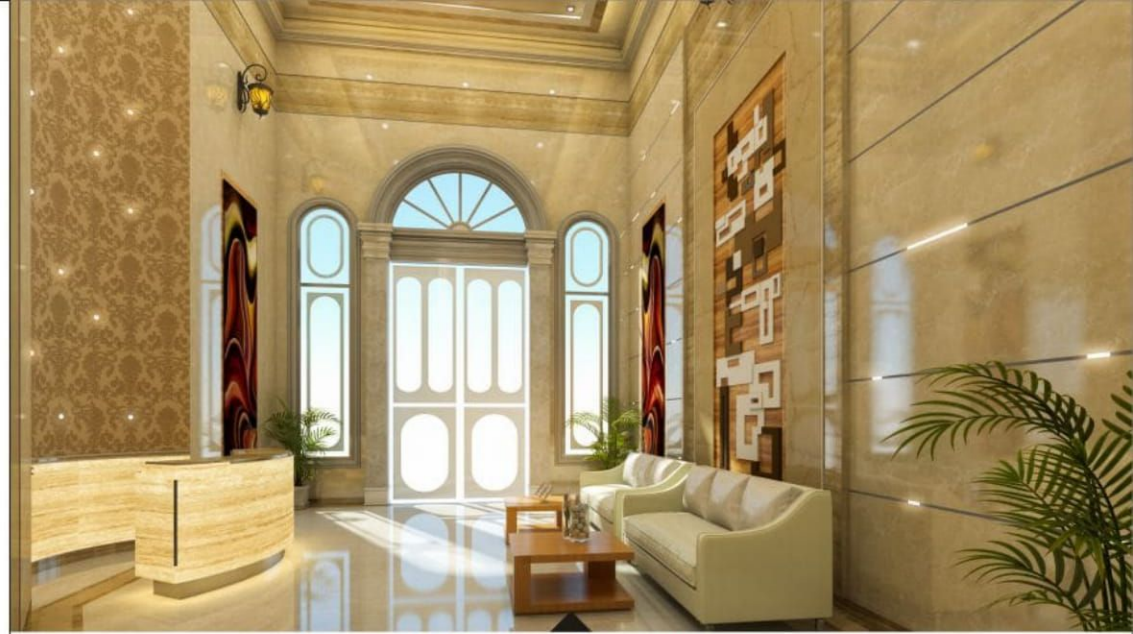
Airconditioned Entrance Lobby