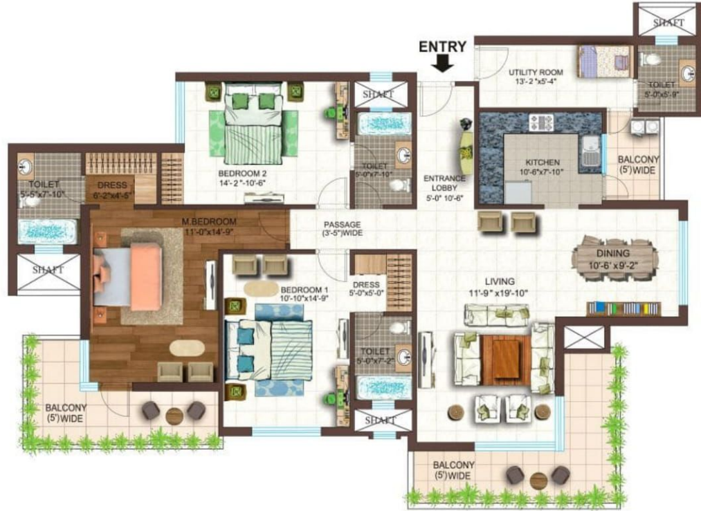
Typical Floor Unit Type-A 3BHK + Servant - Unit Area: 2,095 Sq. Ft.