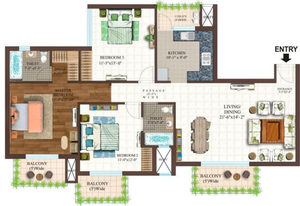
Typical Floor Unit Type-B 3BHK - Unit Area: 1,675 Sq. Ft.