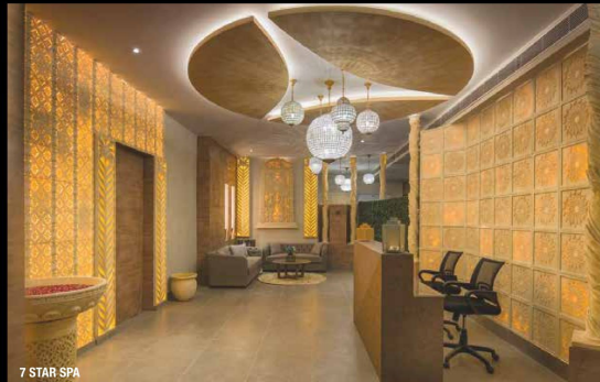
7 STAR SPA