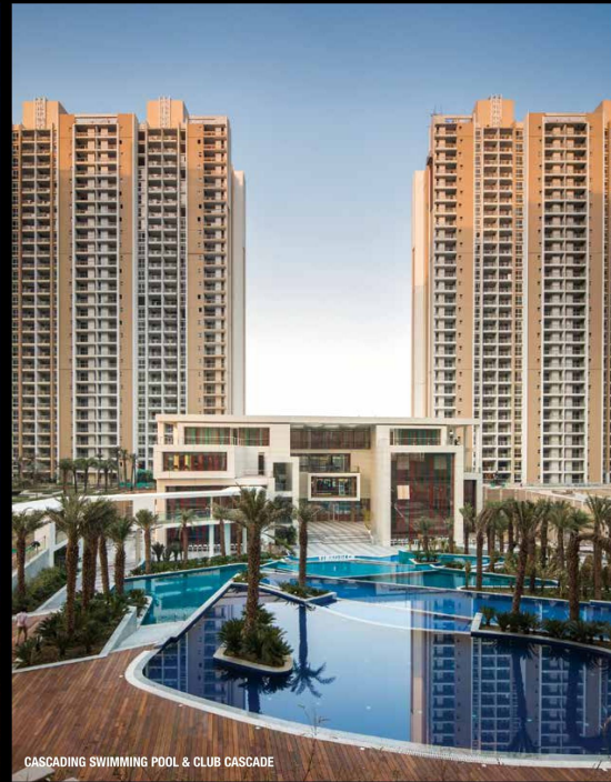
CASCADING SWIMMING POOL & CLUB CASCADE