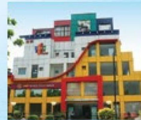
SG BETA TOWER Sec-3, Vasundhara, Ghaziabad Commercial