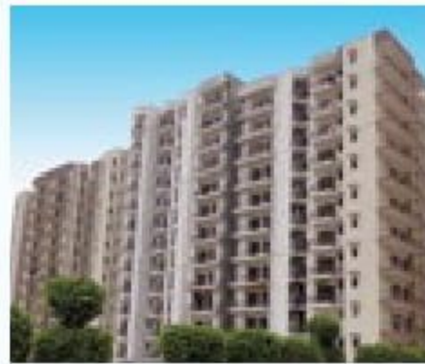
SG IMPRESSIONS 58 Phase-2, Rajnagar Extn., Ghaziabad