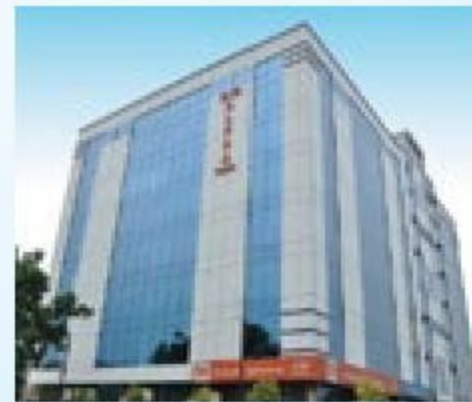
SG ALPHA TOWER Sec-9, Vasundhara, Ghaziabad Commercial