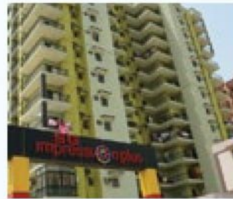
SG IMPRESSIONS PLUS Rajnagar Extn., Ghaziabad