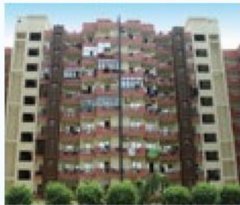
SG IMPRESSIONS Sec-4B, Vasundhara, Ghaziabad