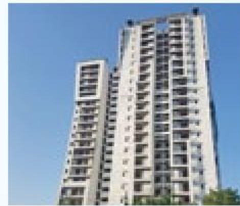
SG OASIS Vasundhara, Ghaziabad