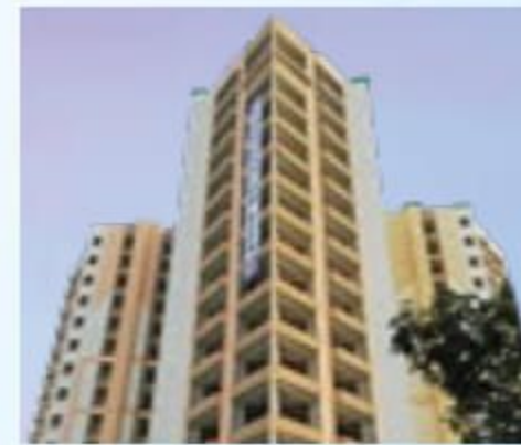
SG BENEFIT Govindpuram, Ghaziabad