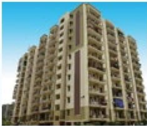
SG IMPRESSIONS 58 Rajnagar Extn., Ghaziabad