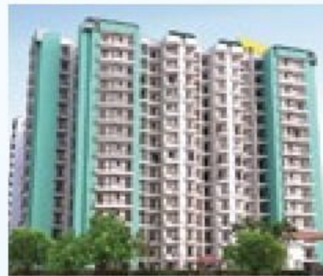
SG HOMES Sec-3, Vasundhara, Ghaziabad