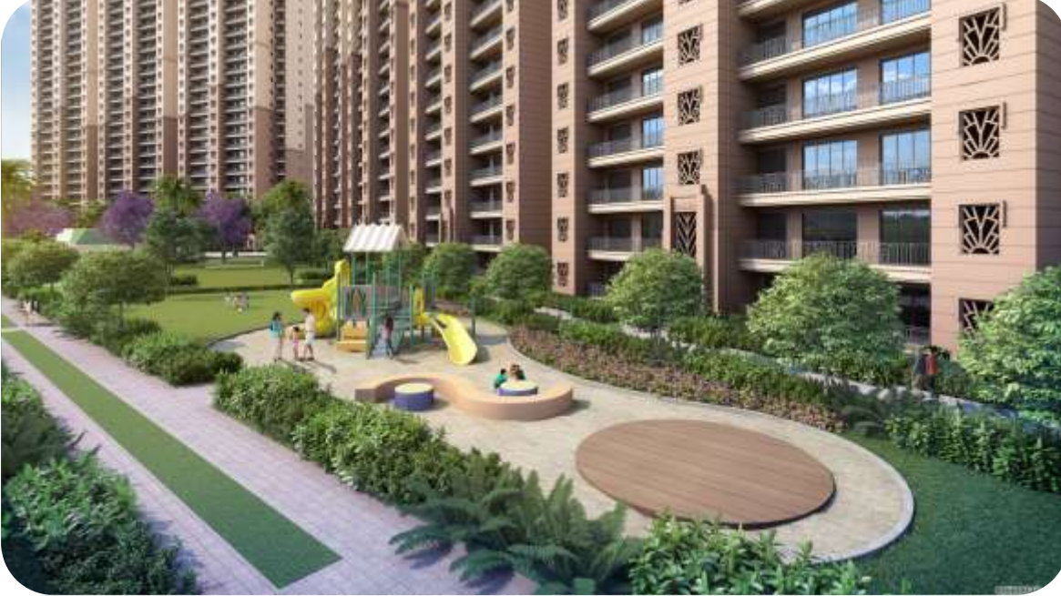
Kid's Play Area