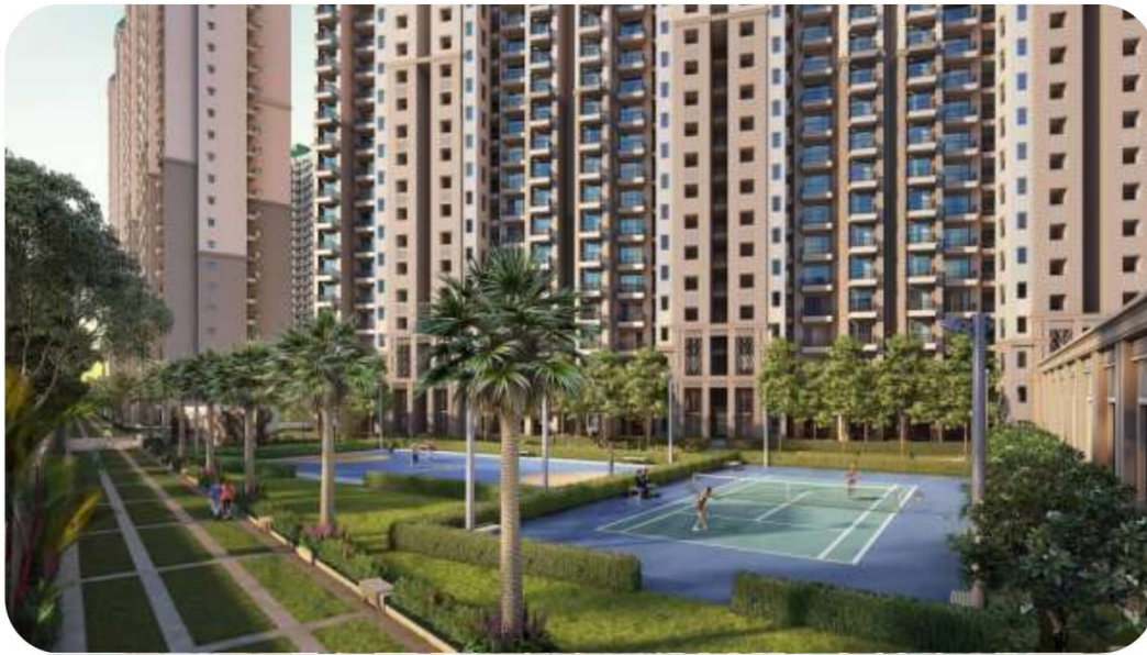
Basket Ball & Tennis Court Area