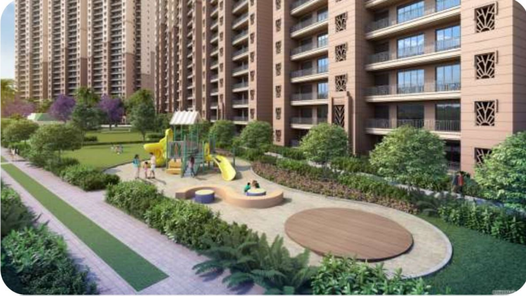
Kid's Play Area