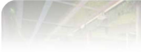
Club House Swimming Pool View