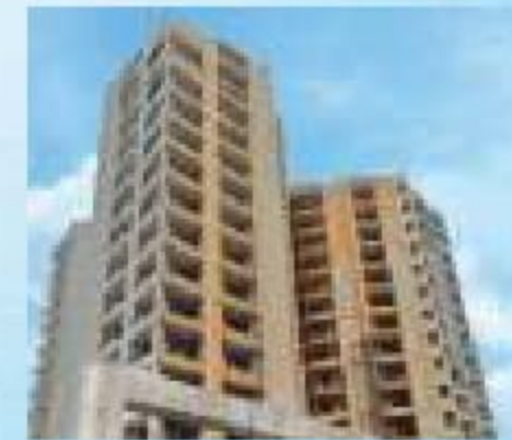
SG Benefit Govindpuram, Ghaziabad