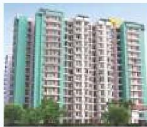
SG Homes Sec-3, Vasundhara, Ghaziabad