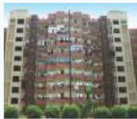
SG Impressions Sec-4B, Vasundhara, Ghaziabad