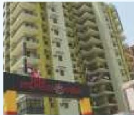
SG Impressions Plus Rajnagar Extn., Ghaziabad