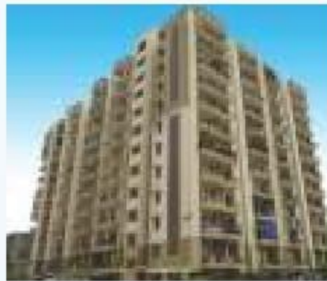
SG Impressions 58 Rajnagar Extn., Ghaziabad