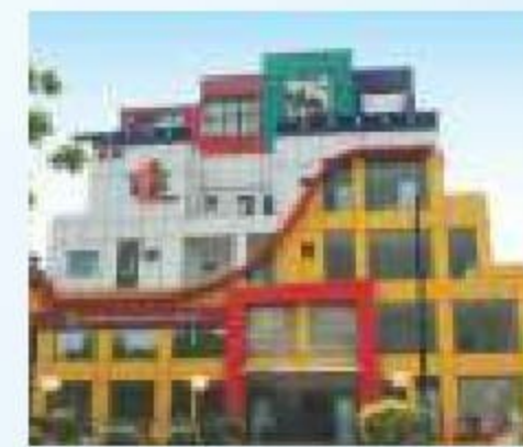
SG Beta Tower Sec-3, Vasundhara, Ghaziabad Commercial