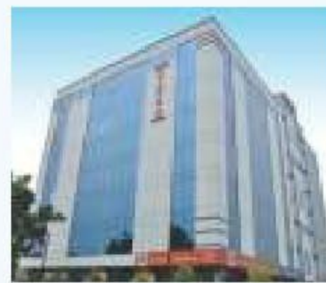
SG Alpha Tower Sec-9, Vasundhara, Ghaziabad Commercial