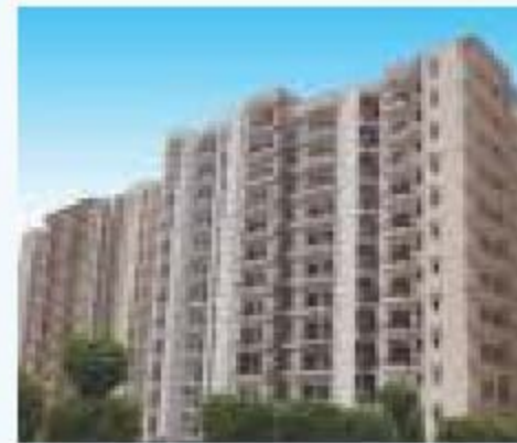
SG Impressions 58 Phase-2, Rajnagar Extn., Ghaziabad