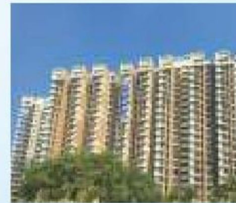
SG Grand Rajnagar Extn., Ghaziabad