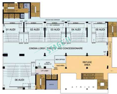
BLOCK - X

Note: Typical Shops Nos.: X/A FOF XXX | X/A - Block | FOF - Fourth Floor | XXX - Shop Number