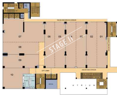
BLOCK - X

Note: Typical Shops Nos.: X/A TF XXX | X/A - Block | TF - Third Floor | XXX - Shop Number