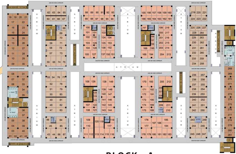
BLOCK - A