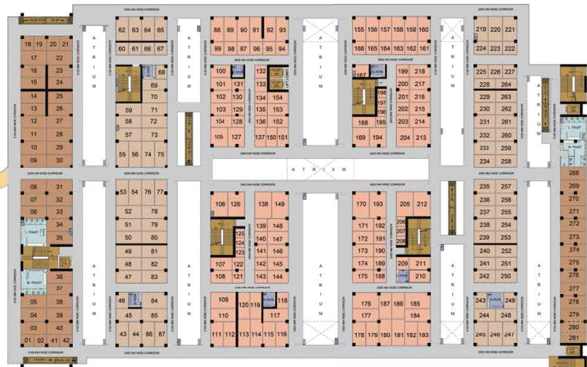
BLOCK - A