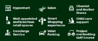
This is an Artistic Representation

Sikka Mall of Noida is a consummate destination for businesses, retail giants and world-savvy professionals to blossom in. It provides avid shoppers with a plethora of well-appointed retail options, right from a Hypermarket, to anchor stores, to the world's most loved brands and labels, to high-end showrooms.