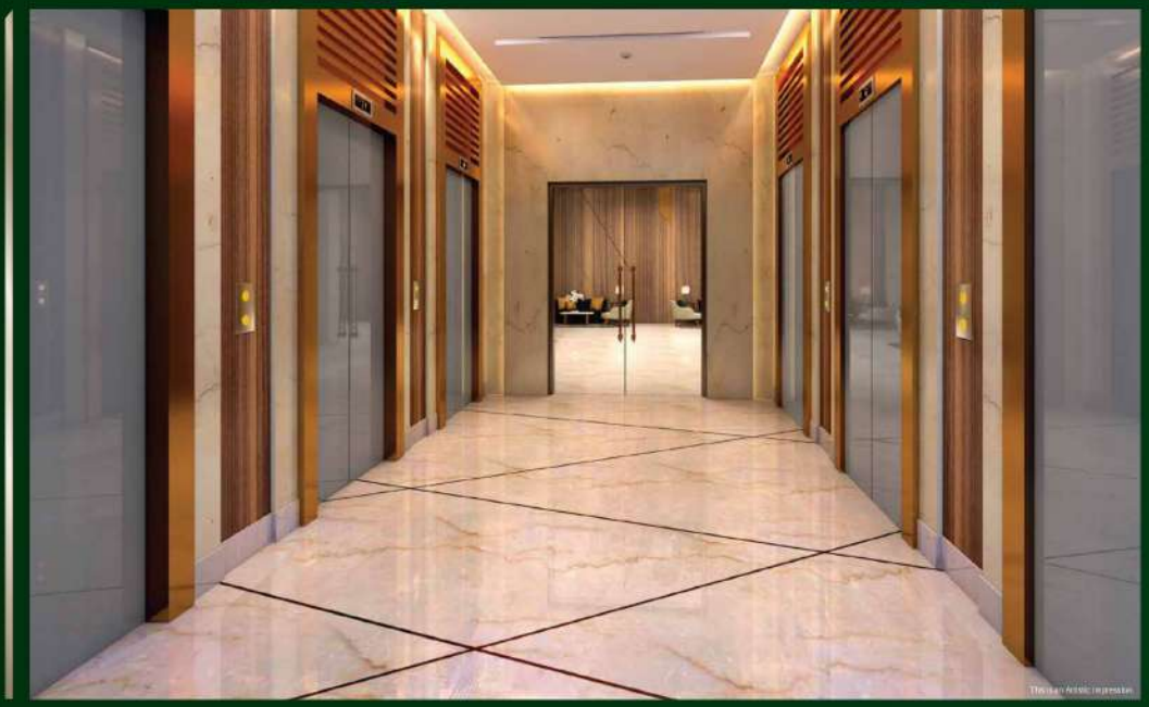
Thalaya - Atrium (entrance)