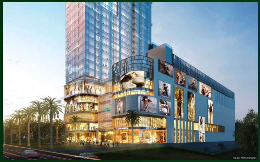
This is an artistic impression.