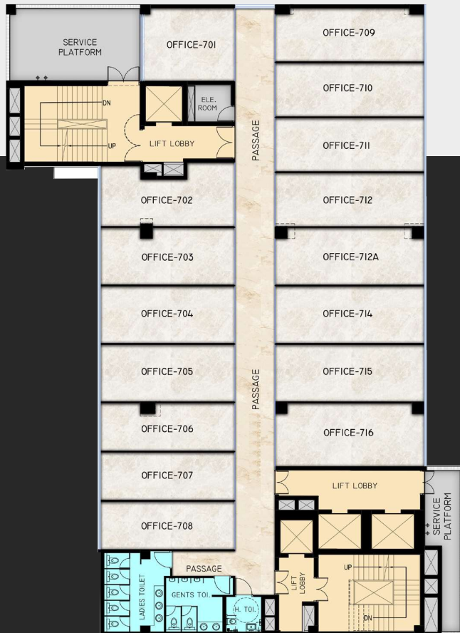
*7th, 8th, 9th, 11th, 12th, 12th A, 14th