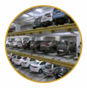
MULTI LEVEL CAR PARKING