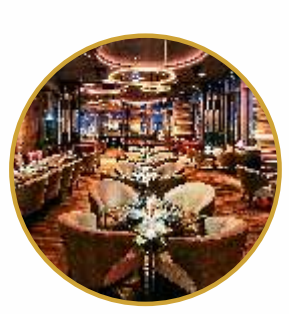
FINE DINING & RESTAURANT