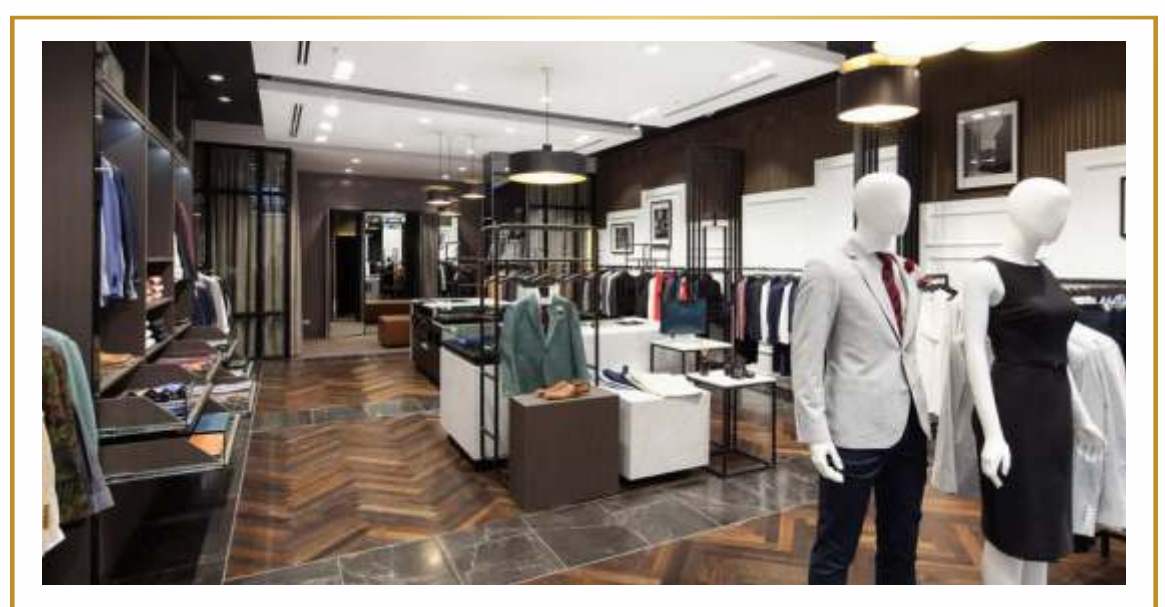
APPAREL & JEWELLERY ZONE