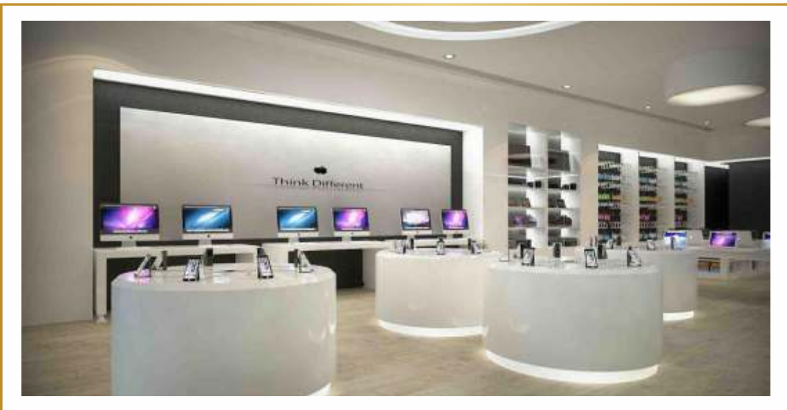
IT & ELECTRONIC ZONE