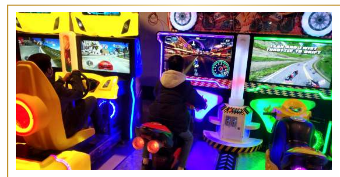
GAMES & ENTERTAINMENT ZONE