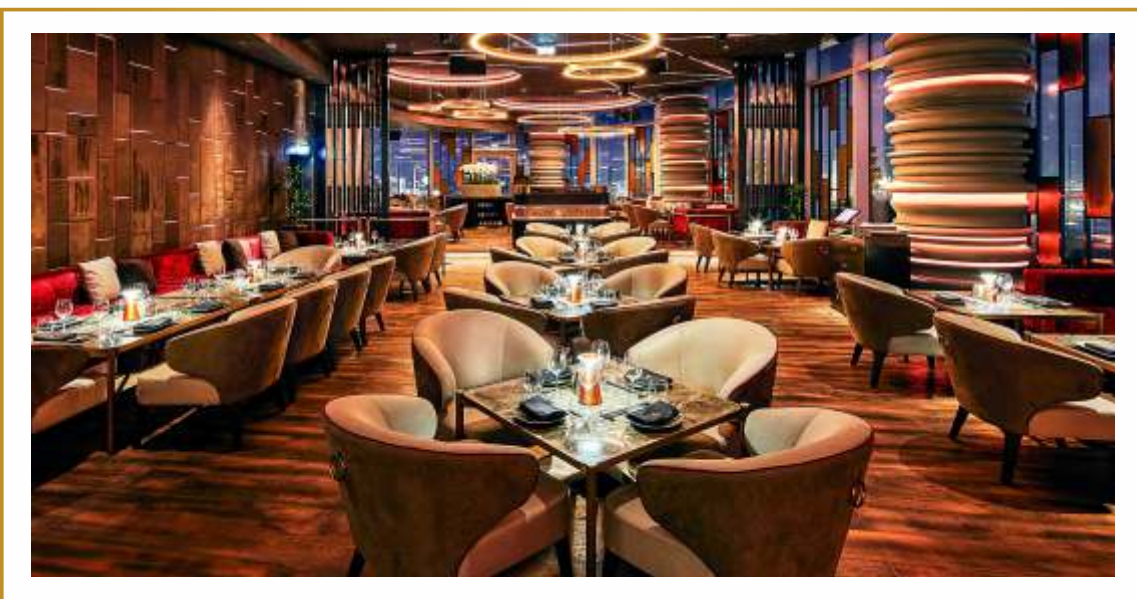
RESTAURANT & FINE DINING